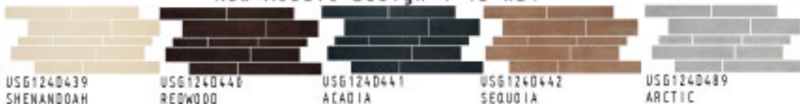
USG1240439 USG1240440 USG1240441 USG1240442 USG1240489 SHENANDOAH REDWOOD ACADIA SEQUOIA ARCTIC