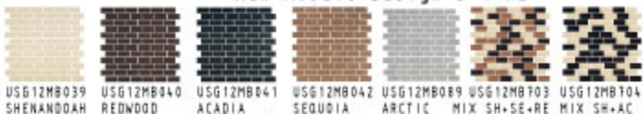
USG12MB039 USG12MB040 USG12MB041 USG12MB042 USG12MB089 USG12MB703 USG12MB704 SHENANDOAH REDWOOD ACADIA SEQUOIA ARCTIC MIX SH+SE+RE MIX SH+AC