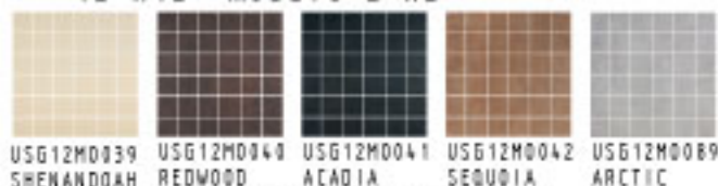
USG12M0039 USG12M0040 USG12M0041 USG12M0042 USG12M0089 SHENANDOAH REDWOOD ACADIA SEQUOIA ARCTIC