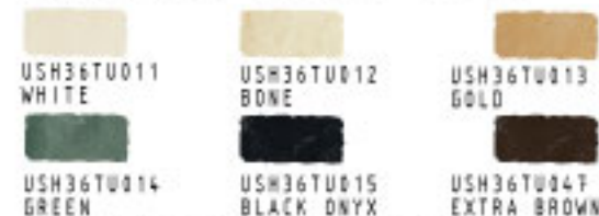
USH36TU011 WHITE USH36TU012 BONE USH36TU013 GOLD USH36TU014 GREEN USH36TU015 BLACK ONYX USH36TU017 EXTRA BROWN