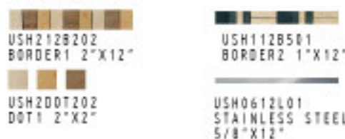
USH212B202 BORDER1 2"x12" USH2D0T202 DOT1 2"x2" USH112B501 BORDER2 1"x12" USH0612L01 STAINLESS STEEL 5/8"x12"