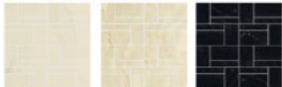
USP12D2011 WHITE POLISHED USP12D2012 BONE POLISHED USP12D2015 B.ONYX POLISHED USH12D2011 WHITE HONED USH12D2012 BONE HONED USH12D2015 B.ONYX HONED