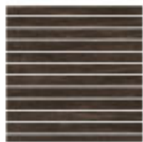
USG12M6087 M. RETREAT 1"x12"