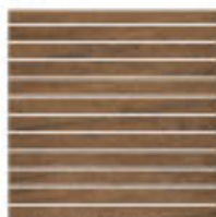
USG12M6086 C. FARM 1"x12"