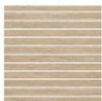
USG12M6085 BEACH HOUSE 1"x12"